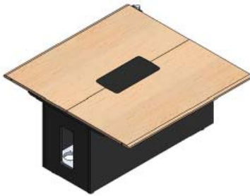
Code T3600 EXT44 (Middle ∞ or End Against Wall)