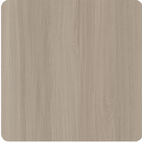
Saratoga Blonde - SBT