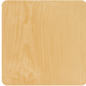
Fusion Maple - FMT