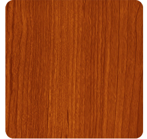
Hayward Cherry - HCT