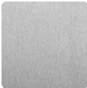
Silver Silk - SST