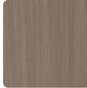
Avery Suede - AST