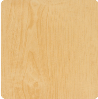
Fusion Maple - FMT