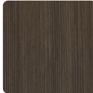
Baroque - BRT