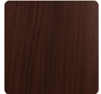
Elegance - ELT