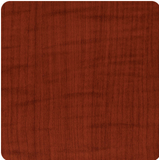
Crossfire Java - CJT