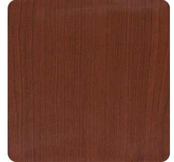
Clove - CLT