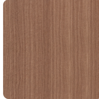
River Cherry - RCT