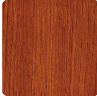
Hayward Cherry- HCT