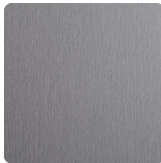
Brushed Aluminum - BAT