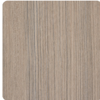
Aria - ART